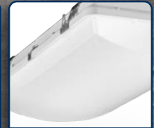
Frosted Acrylic Lens