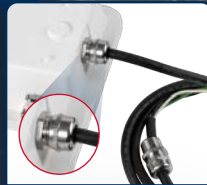
Specialized Cord & Fittings