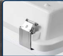
Stainless Steel Latches