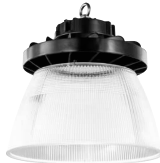
RHB16PAR Prismatic Acrylic Refractor