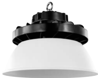
RHB16SAR White Spun Aluminum Reflector