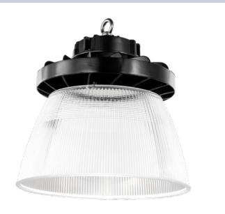
RHB16PAR Prismatic Acrylic Refractor